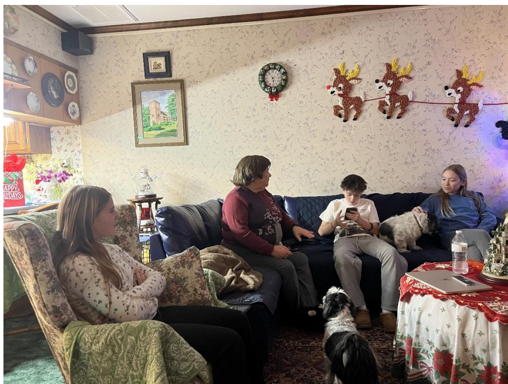
After Dinner Conversation