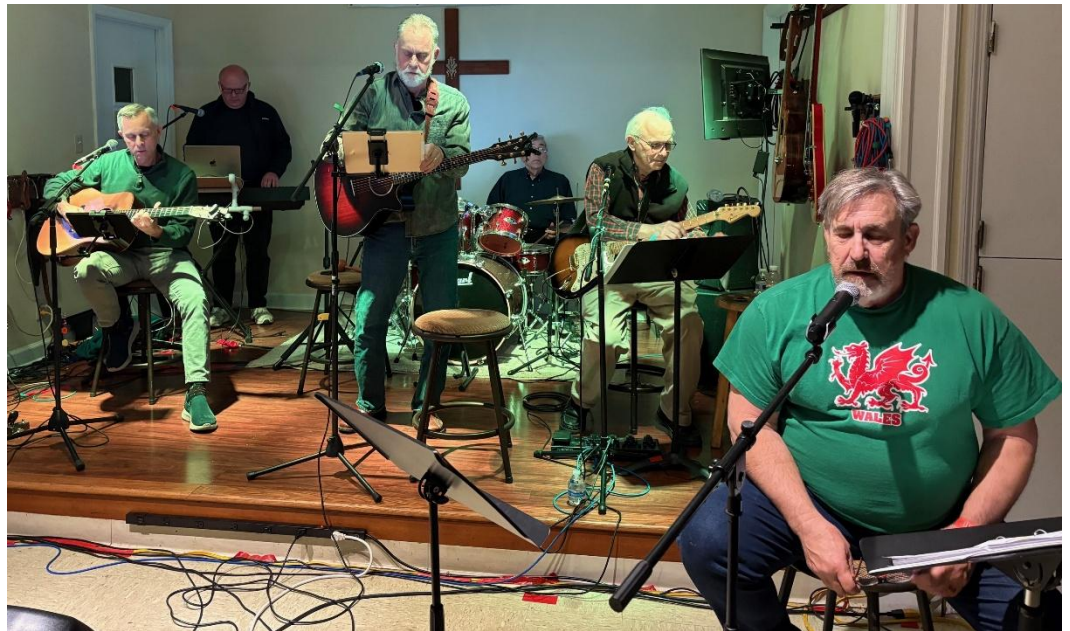
Jam'N sang: "You Ain't Goin Nowhere" and "Wagon Wheel".