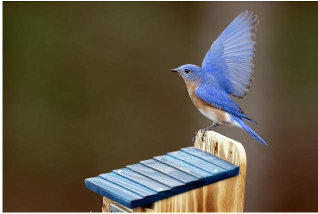
Photo 3 - Male landing on bird house.